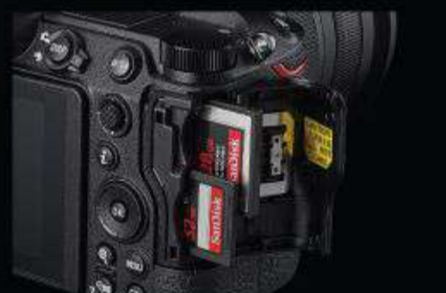
DUAL CARD SLOTS