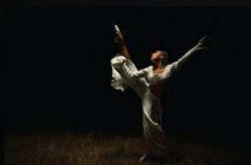
14 FPS ON 12-BIT RAW *1