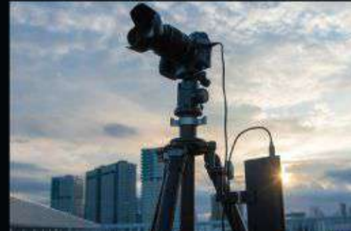
ONE CABLE DOES IT ALL