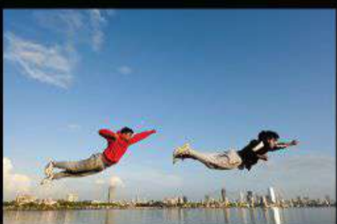
DUAL PROCESSOR 3x BUFFER CAPACITY