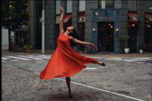
12-BIT PRORES RAW *2